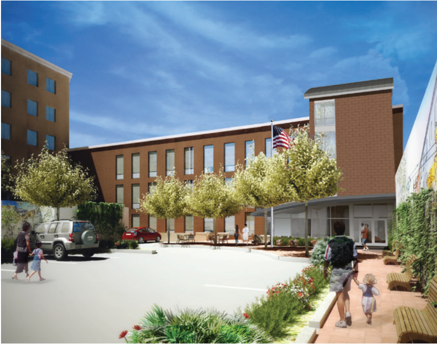
The Impact Services Veterans and Family Housing Center will provide 26 units of housing in the Kensington section of Philadelphia.